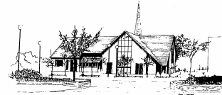
Holy Trinity Shaw