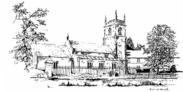
St. Mary's Lydiard Tregoze