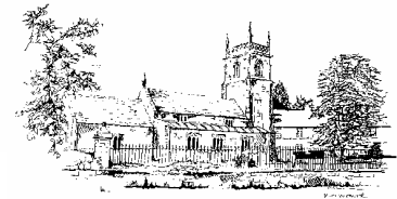
St. Mary's Lydiard Tregoze