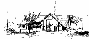
Holy Trinity Shaw