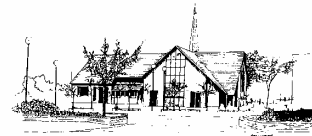
Holy Trinity Shaw