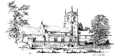
St. Mary's Lydiard Tregoze