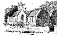
All Saints Lydiard Millicent