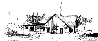
Holy Trinity Shaw